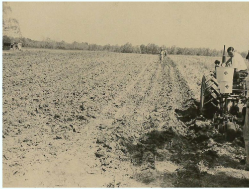
May 1964, Photo of minimum till corn being planted in Great Mills, MD