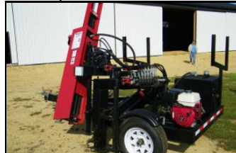
Shaver Post Driver Purchased September 2010 $150/day SMADC