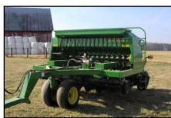
10 Ft John Deere No-Till Drill Purchased April 2008 $25/day $10/ac CBT