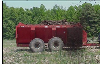
16Ft Gehl Manure Spreader Purchased December 2000 $25/day $10/ac