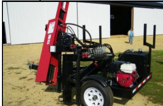
Shaver Post Driver Purchased September 2010 $150/day SMADC