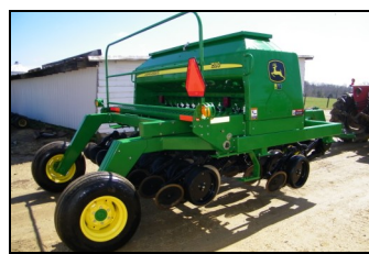
10 Ft John Deere No-Till Drill Purchased December 2012 $25/day $10/ac SMADC