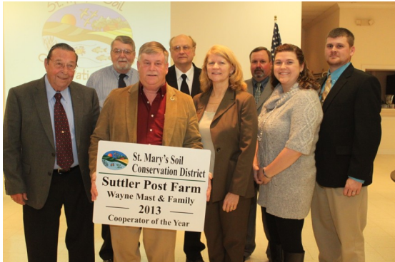
District Board presenting farm sign at Cooperators Dinner held February 21, 2014