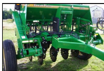
7 Ft Great Plains No-Till Drill Purchased September 2010 $25/day $10/ac SMADC