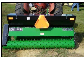
6 Ft Frontier Overseeder Purchased September 2010 $25/day $10/ac SMADC