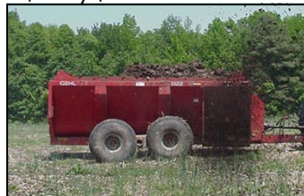
16ft Gehl Manure Spreader Purchased December 2000 $25/day $10/ac