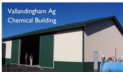
Vallandingham Ag Chemical Building

improve water quality within the Bay. CBWI addresses animal waste, cropland and pastureland. NRCS will administer the initiative as part of its Environmental Quality Incentives Program.