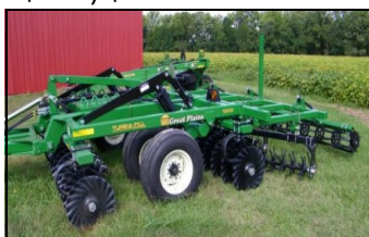
12 ft Great Plains Turbo Till Purchased September 2010 $25/day $10/ac SMADC