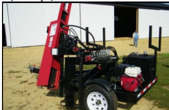
Shaver Post Driver Purchased September 2010 $150/day SMADC